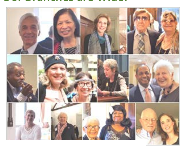
We Cast A Large Shadow!